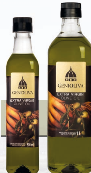
MARASCA PET BOTTLE 1L, 750 ML, 500ML, 250 ML