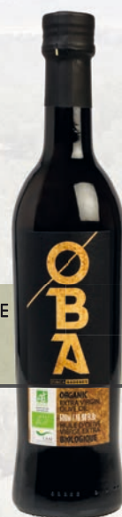
BORDELESA GLASS BOTTLE 500 ML