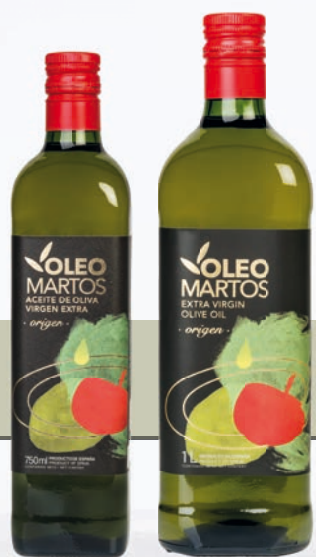
MARASCA GLASS BOTTLE 1L, 750 ML, 500ML, 250 ML