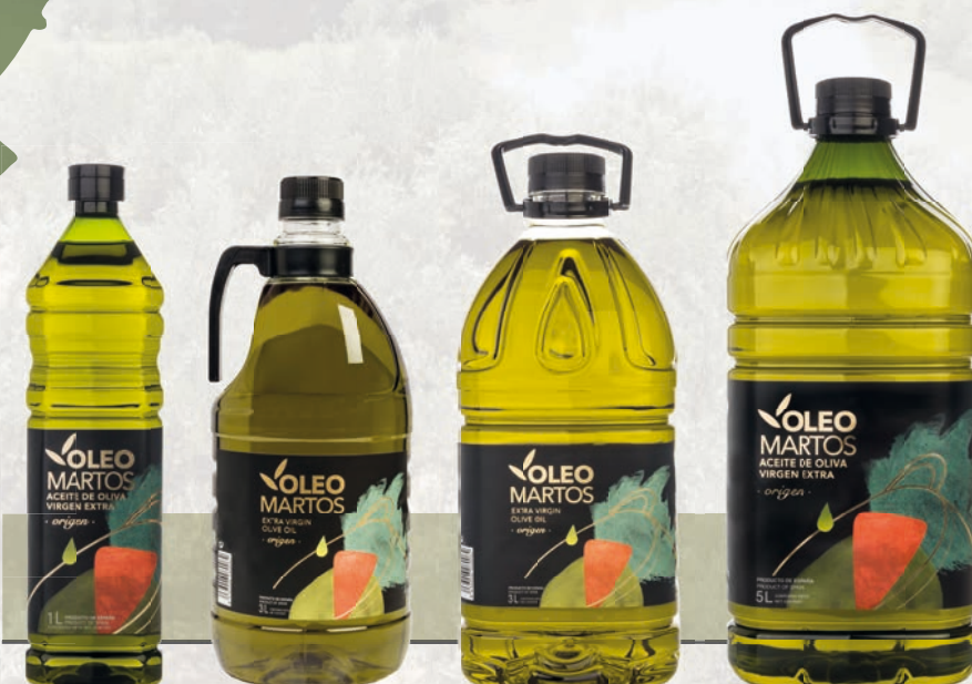
PET BOTTLE 1L, 1,5L, 2L, 3L, 5L