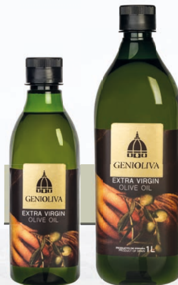
BERTOLI PET BOTTLE 1L, 500 ML