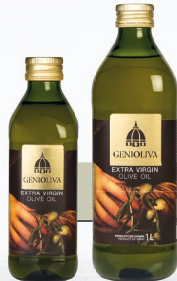
BERTOLI GLASS BOTTLE 1L, 500 ML, 250 ML