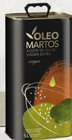
TIN 1L, 3L, 5L