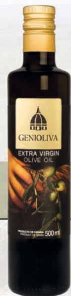
DÓRICA GLASS BOTTLE 750 ML, 500 ML